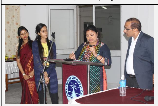
Presentation by participants