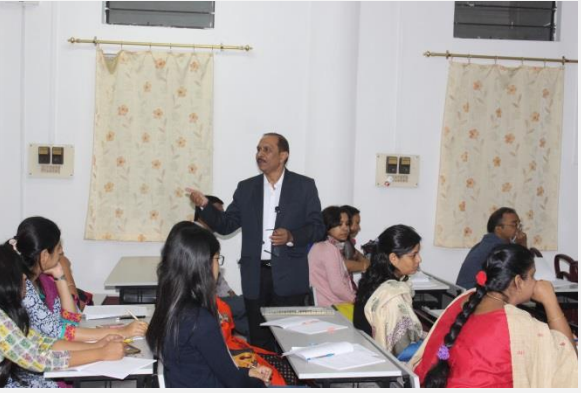
Interactive session with Resource person